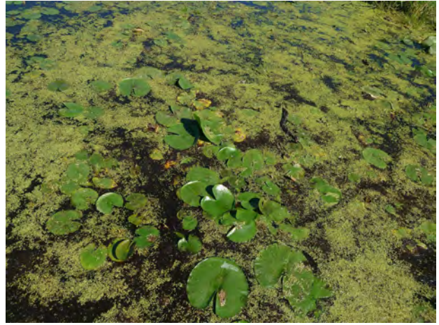
Water lilies and Duckweed