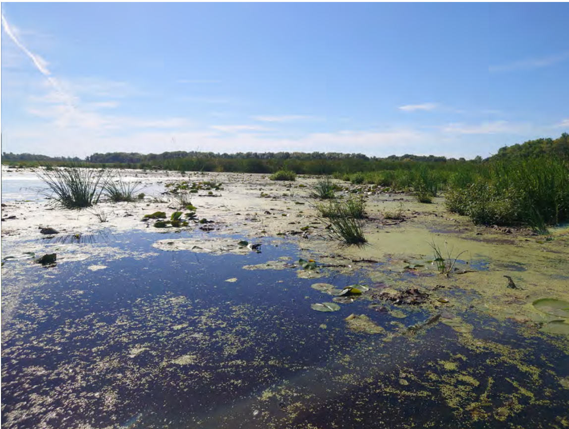
Figure 1. View of Sutton Lake.

Aquatic plant growth was observed in 100% of the wetted area in Sutton Lake.