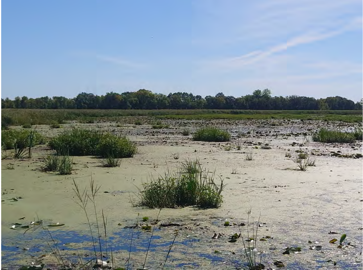
Water Lilies and Duckweed were abundant in Sutton Lake, September 2022