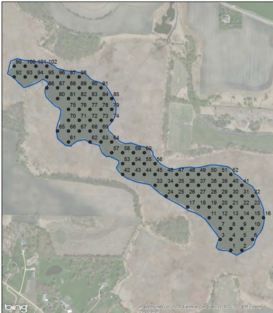
Figure 3. Sample locations for the point intercept aquatic plant survey.

However, drought conditions resulted in lake water depths of one to six inches. Soft sediments were up to two feet thick. Navigation by boat or by walking was not feasible. Therefore qualitative estimates were made along with visual observations.