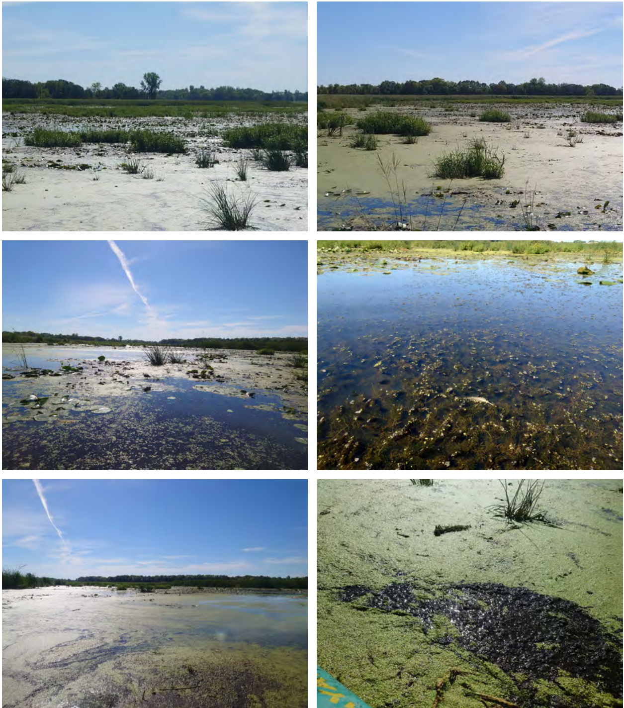
Figure 2. Emergent plants were common in Sutton Lake in 2022. Wild rice and bullrush were found in several locations on September 1, 2022. White water lilies were common while no spatterdock was observed. Coontail was present where water depth 3 inches or greater. Duckweed was growing throughout the basin.