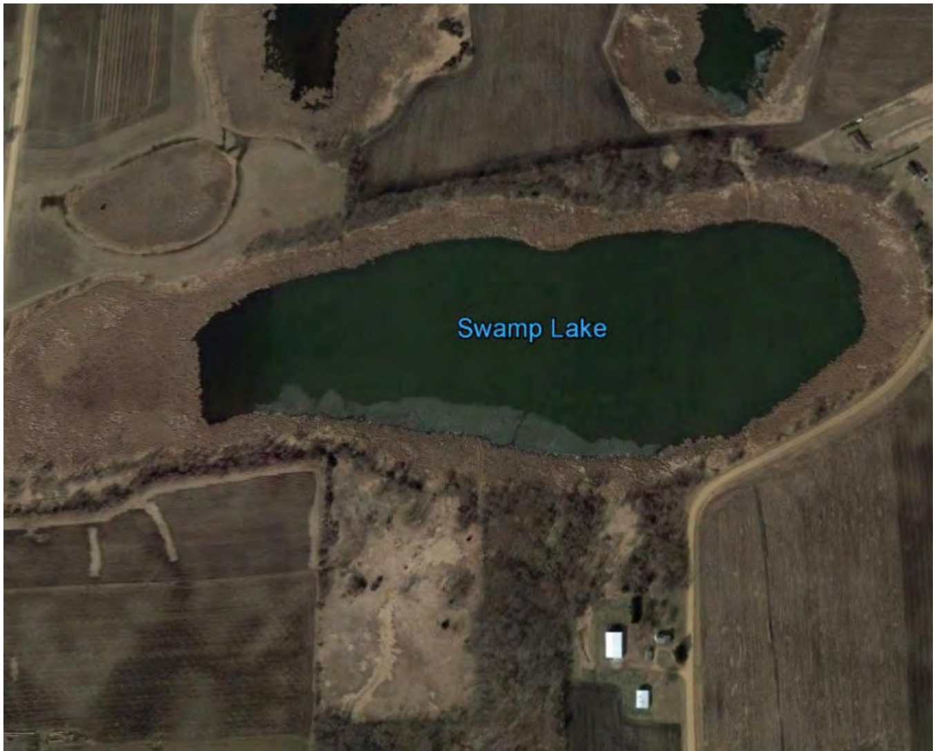
Swamp Lake, Scott County, Minnesota