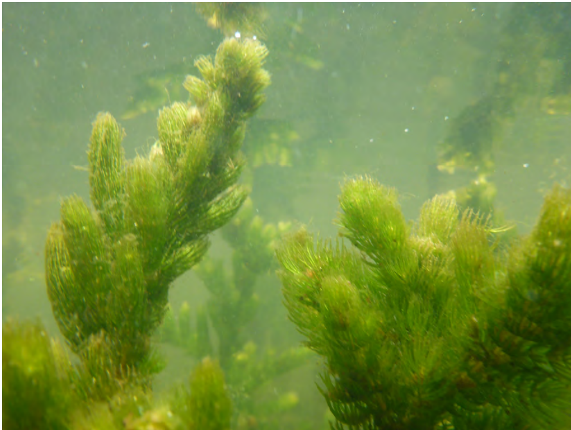
Figure S1. Coontail, shown underwater, was the most common plant sampled in Swamp Lake in 2016.

No Eurasian watermilfoil was found in this survey.