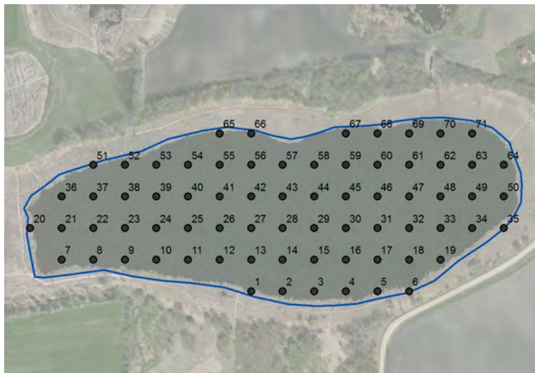
Figure 1. Sample location map for the aquatic plant survey conducted on Swamp Lake.

An aquatic plant point-intercept survey of Swamp Lake was conducted by Blue Water Science on August 31, 2016 and 71 points were sampled. Sample points were placed 50 meters apart on a grid that covered the lake (Figure 1). At each sample point, a sampling rake was lowered into the water and a plant sample was taken. The plant species were recorded and the density of each species was assigned. Densities were based on the coverage on the teeth of the rake. Density ratings were from 1 to 5 with 1 being sparse and 5 being a nuisance. Based on these sample sites, a plant distribution map was constructed.