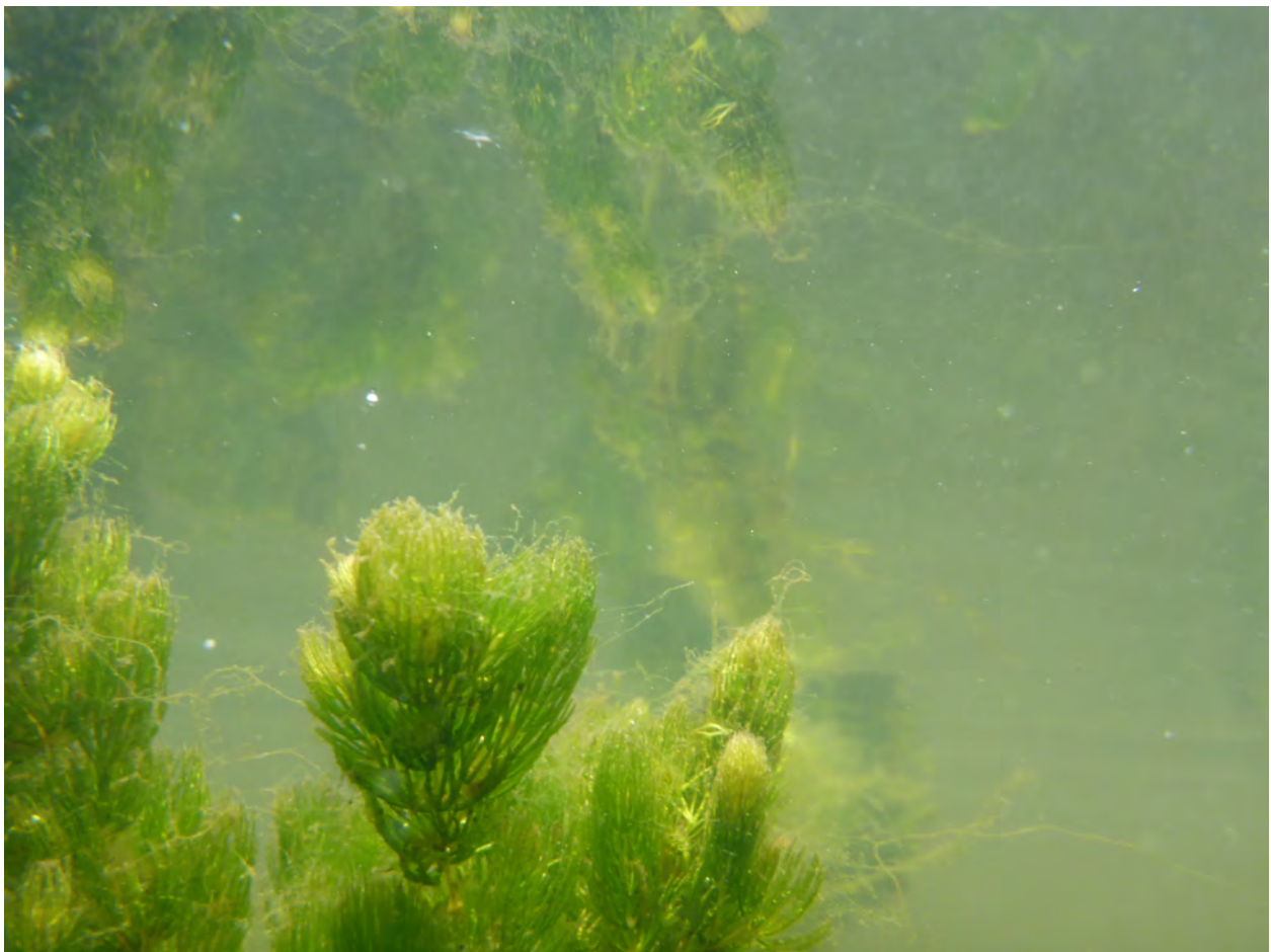
Figure 4. Coontail, a native plant, was found throughout most of Swamp Lake in 2016.