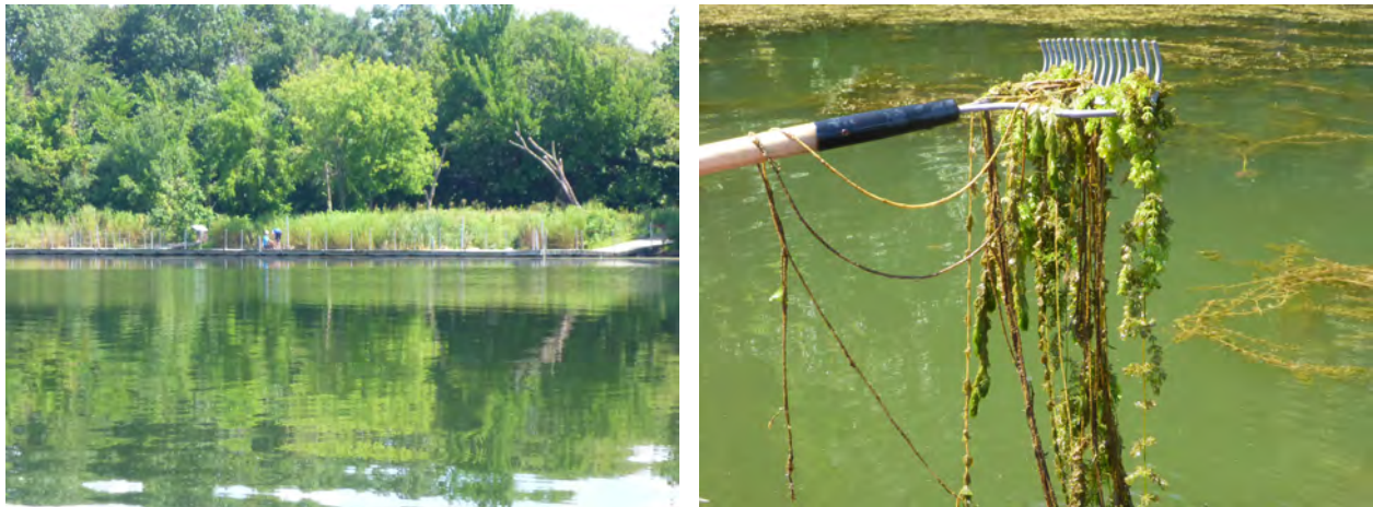
Figure S1. The shoreline of Jeffers Pond has a walking path around the pond, houses are set back from the pond. Jeffers Pond was sampled by canoe. Here plants were sampled with a sampling rake and on the sample rake are coontail and Eurasian watermilfoil.

Eurasian watermilfoil was the dominant plant. Aquatic plant coverage was about 90% of the lake area.