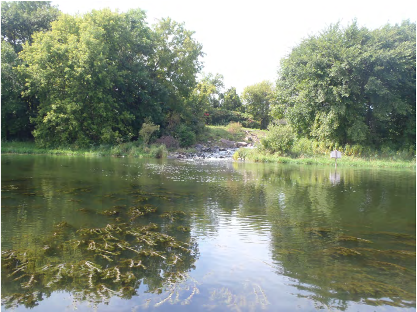
A Stream Enters Jeffers Pond, Scott County, Minnesota, 2017