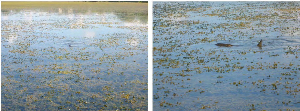
Figure 3. Coontail was topping out around most of Jeffers Pond. Adult carp were observed around Jeffers Ponds well (right).