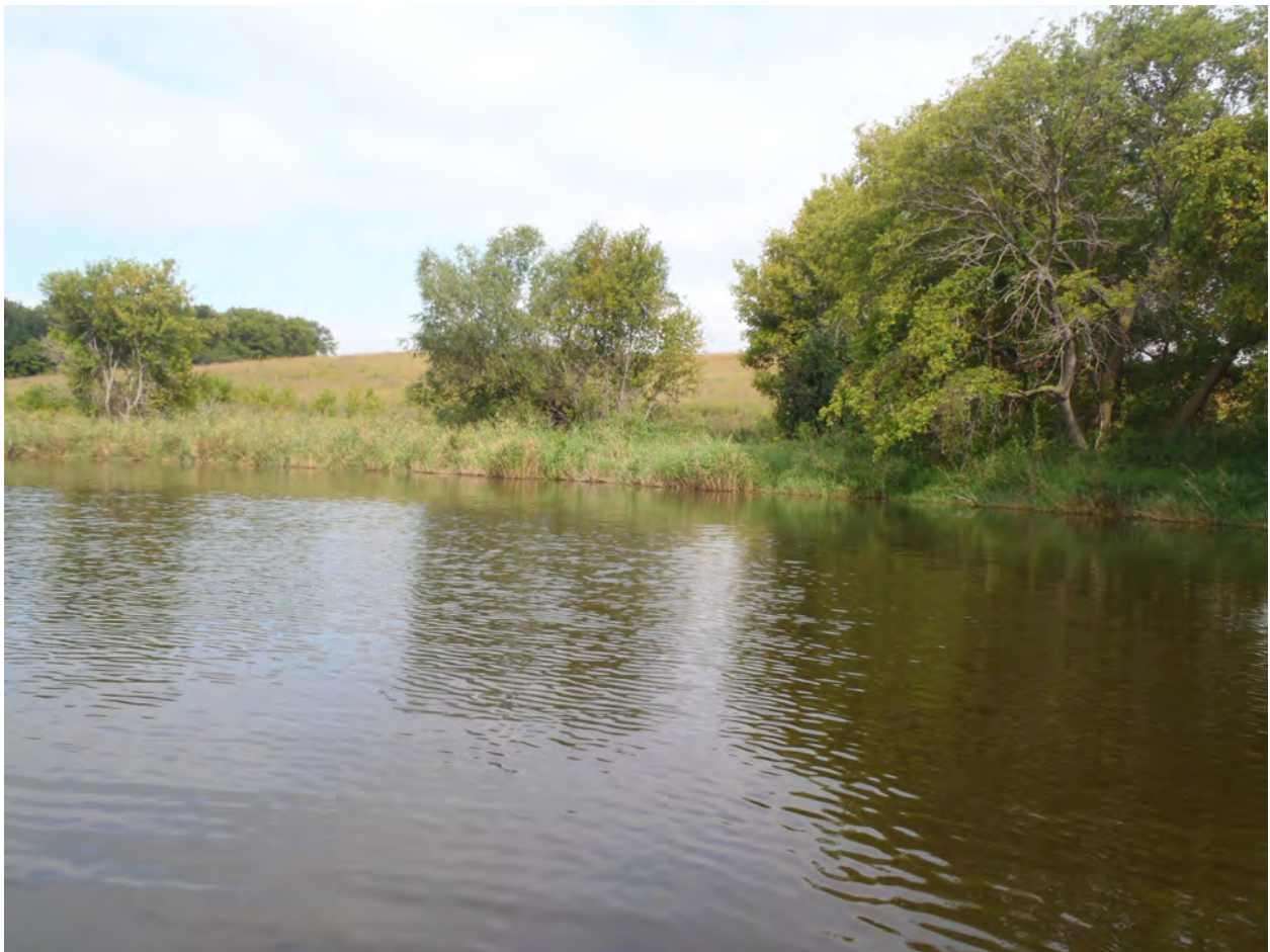
Figure 1. The shoreline of Arctic Lake was mostly undeveloped.

A total of 39 points were surveyed, but no rooted submerged plants were found. However, the entire shoreline was ringed with native wetland plant species.