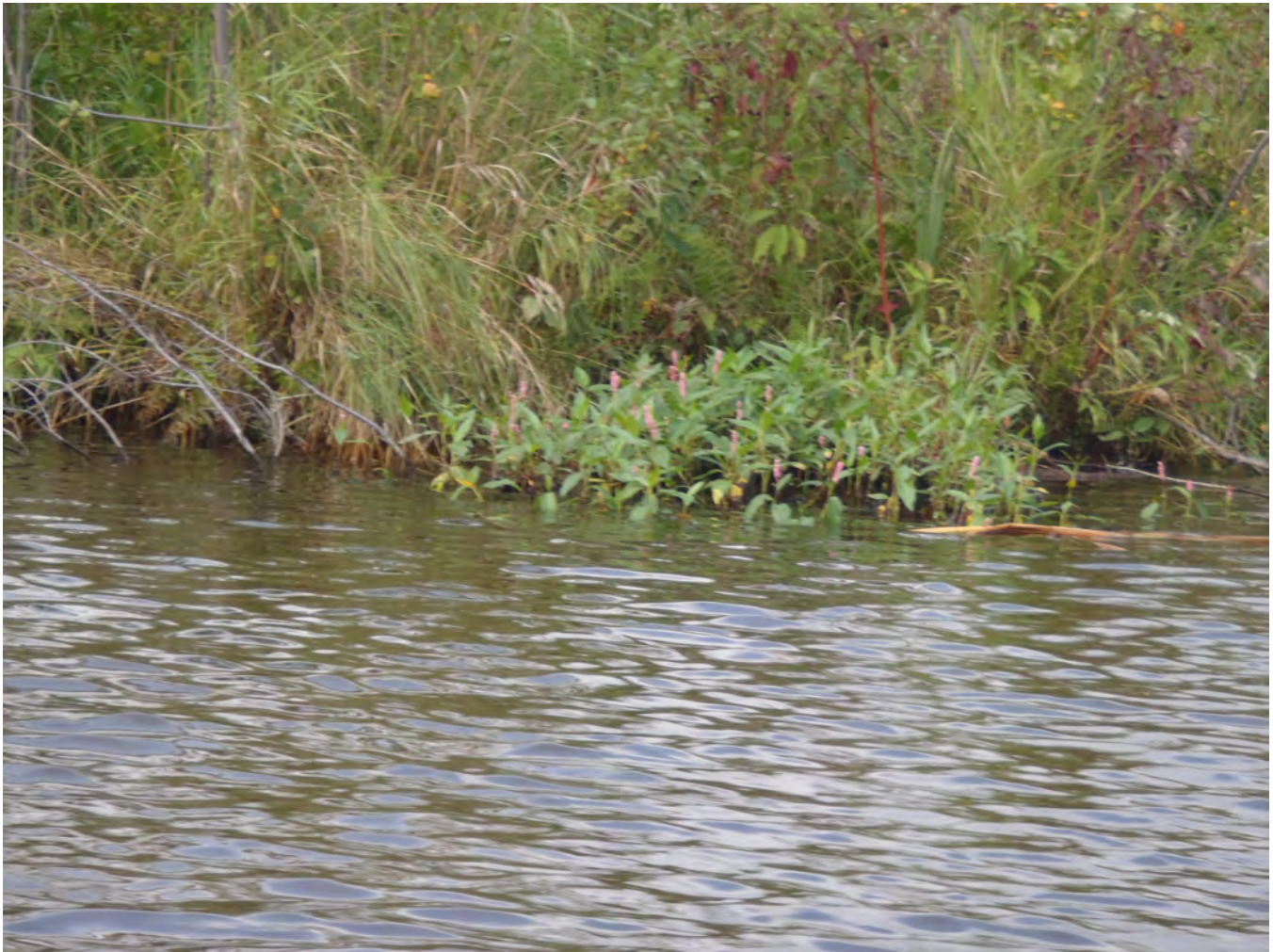
Natural Shoreline on Actic Lake, Scott County, Minnesota, 2016