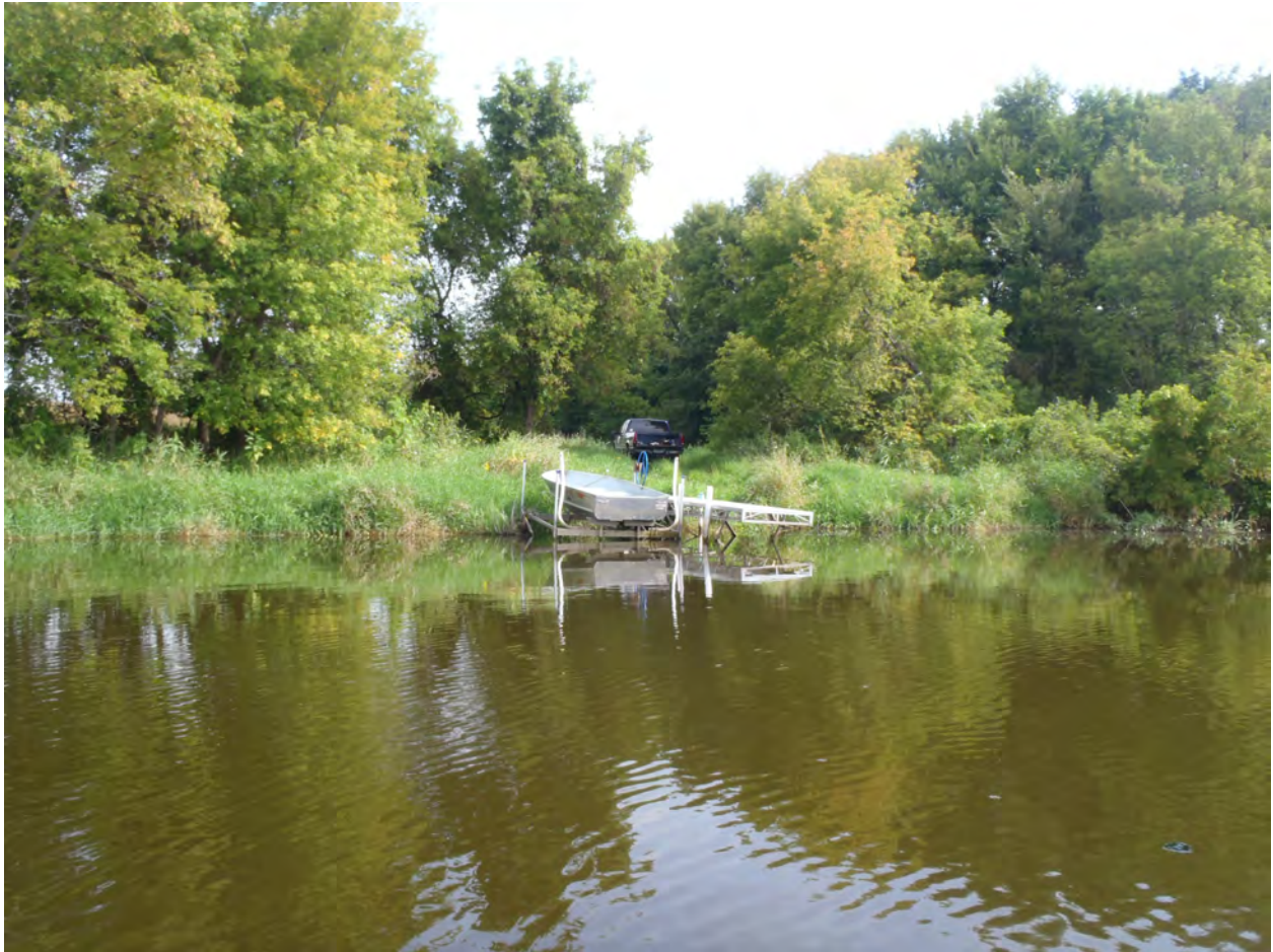
Figure 3. This dock on Arctic Lake is nestled on a natural shoreline. The rest of Arctic Lake's shoreline is natural as well.