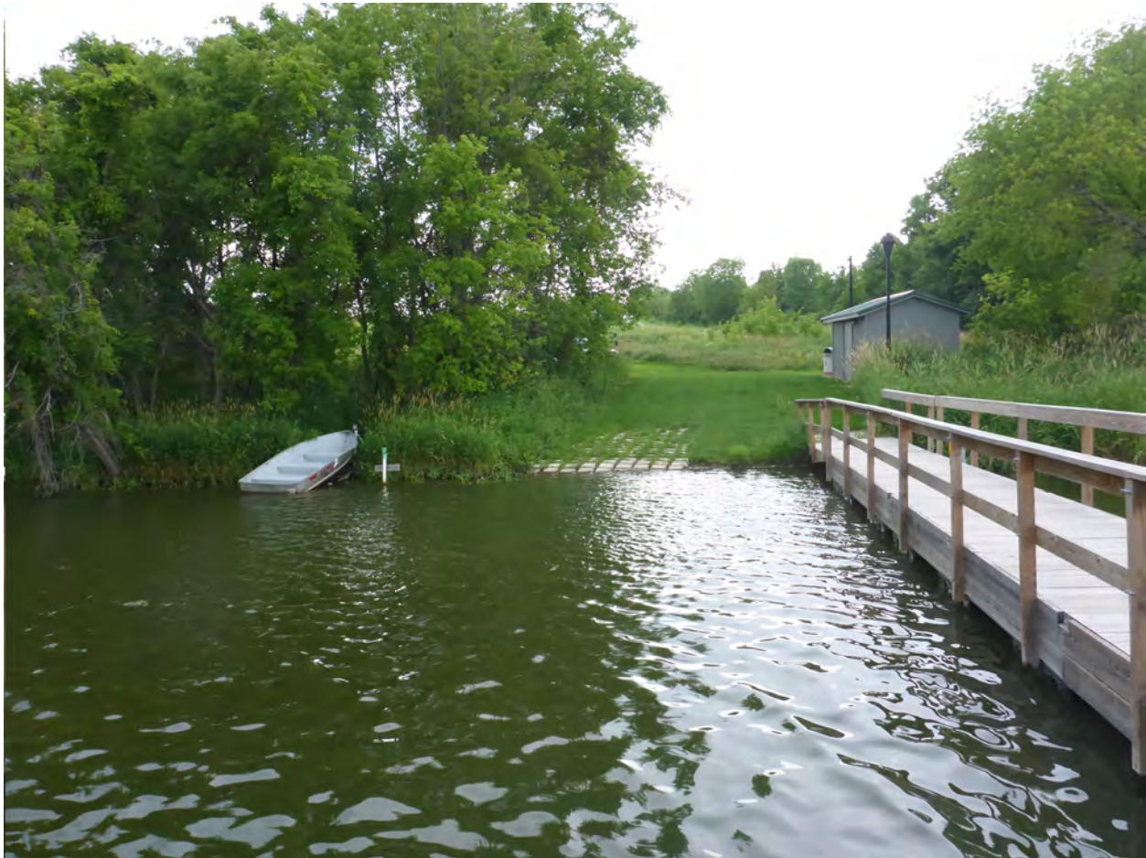
Figure 4. Arctic Lake entry point. The lake access was recently renovated and there is now a fishing pier.