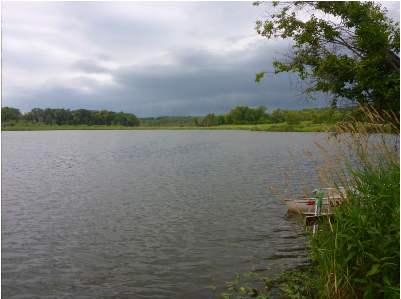
Natural Shoreline on Arctic Lake, Scott County, Minnesota, 2019