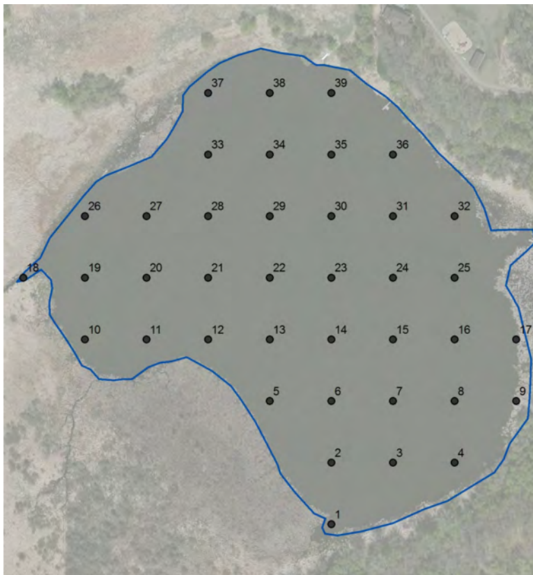
Figure 1. Sample location map for the aquatic plant survey conducted on Arctic Lake.

sites, a plant distribution map was constructed.